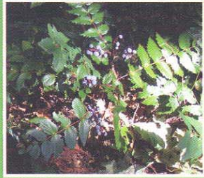
Creeping Oregon Grape Mahonia nervosa