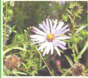
Douglas Aster Aster subspicatus