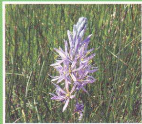
Common Camas Cammasia quamash