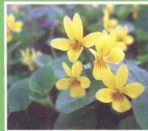
Stream Violet Viola glabella