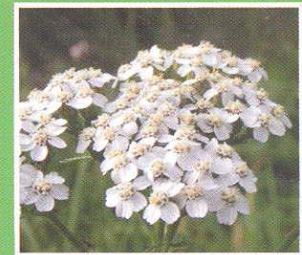
Yarrow Achillea millefolium