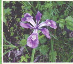
Oregon Iris Iris tenax