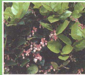
Salal Gaultheria shallon