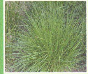
Tufted Hair-grass Deschamsia cespitosa