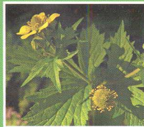
Large-leaved Avens Geum macrophyllum