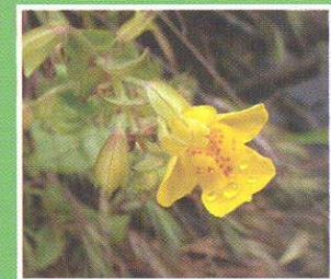
Yellow Monkey-Flower Mimulus guttatus