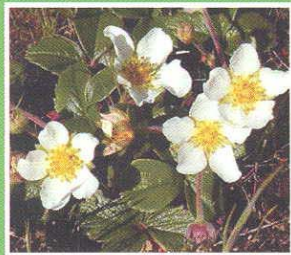
Coastal Strawberry Fragaria chiloensis