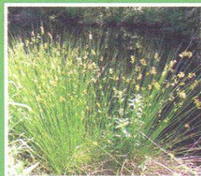
Common Rush Juncus effusus