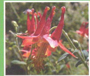
Western Red Columbine Aquilegia formosa