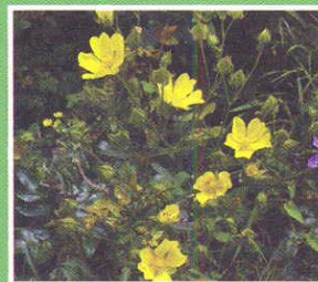
Northwest Cinquefoil Potentilla gracilis